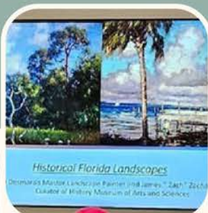
HISTORICAL FLORIDA LANDSCAPES

THANK YOU GENTLEMEN FOR A WONDERFUL PRESENTATION