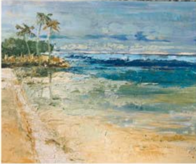
Plantation Key - Oil & Cold Wax, 9 x 12 Framed