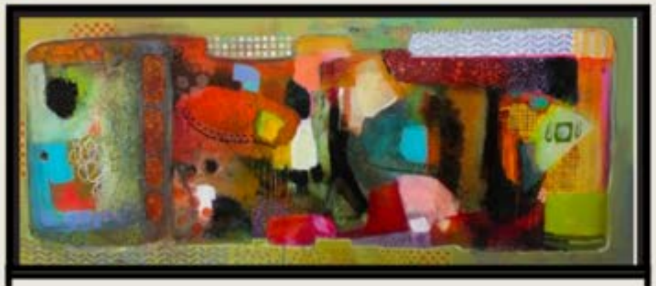
HONORABLE MENTION - KERI IPPOLITO "MANY COLORS, MANY VOICES"