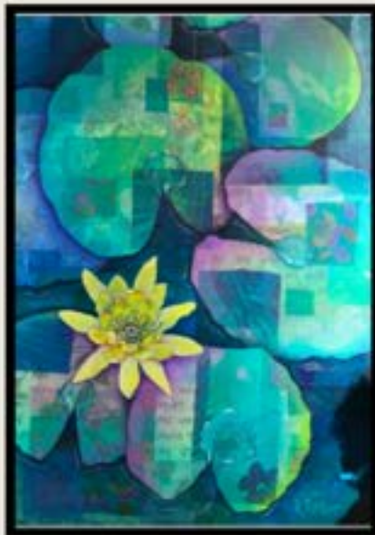
MERIT - KATHY PARKER "LIVING WATERS"