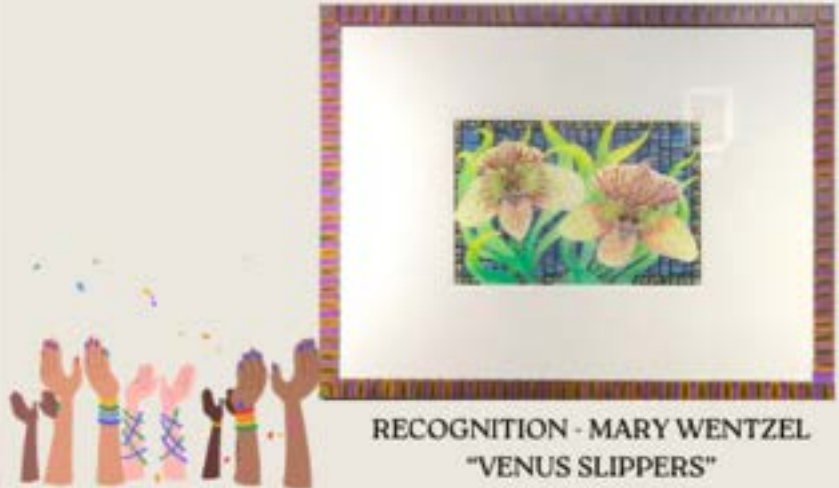
RECOGNITION - MARY WENTZEL "VENUS SLIPPERS"